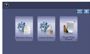
Printer Management: Get quick access to machine status, settings and reports.