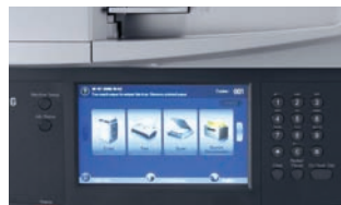
LCD Window: Large display with direct-access menu options.

With the enhancements in place, you can view the entire menu in one glance—this intelligent menu can also be customized to your needs for increased efficiency. While in operation, the on-screen information is also streamlined to individual work processes. When a problem arises, find the fix through simple guided instructions and graphics.