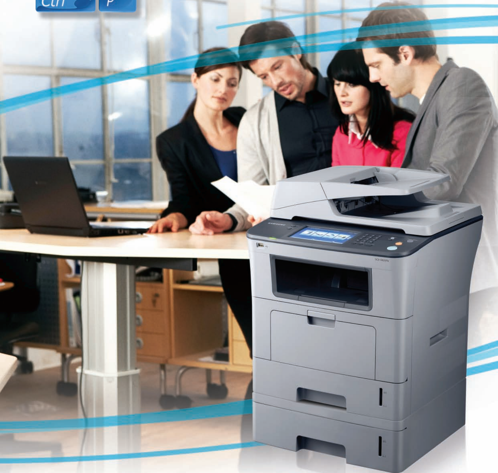
Samsung Multifunction Laser Printer SCX-5835FN