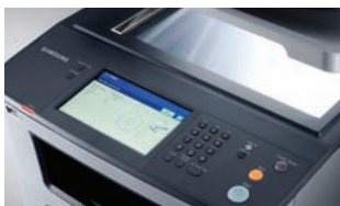
Control Panel: Clean, uncluttered and easy to navigate.

Simplify tasks with a 7-inch colour LCD touch screen that does away with unattractive physical buttons and adds to surrounding décor. Information is displayed clearly and concisely, with most menu options accessible directly from the LCD. Intuitive navigation minimizes operation time. Every second saved counts towards increasing productivity.