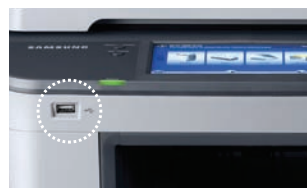
USB Port 1: Located in front for easy and direct access.

Change the way you look at printers, and how you work, with the outstanding features of the SCX-5835FN. A Direct USB port turns it into a self-functioning PC to save time and effort, letting you print and scan directly with a USB drive. The SCX-5835FN is a veritable scanner, with an innovative white LED scanner that scans documents faster and in a higher quality compared to other conventional models.