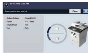
In Operation: Ready screen information minimizes the guesswork.

Breeze through the many functions with a simple-to-use interface. General help can be obtained through the handy “User Tips” feature. To further reduce guesswork, you can also instantly pull up a display of the complete menu flow and organization.