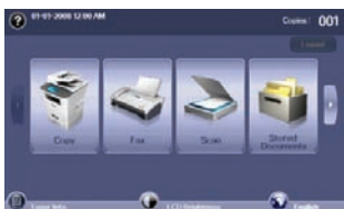
Main Menu: Find everything you need in just one glance.

With the enhancements in place, you can view the entire menu in one glance—this intelligent menu can also be customized to your needs for increased efficiency. While in operation, the on-screen information is also streamlined to individual work processes. When a problem arises, find the fix through simple guided instructions and graphics.