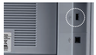
USB Port 2: Additional side port.