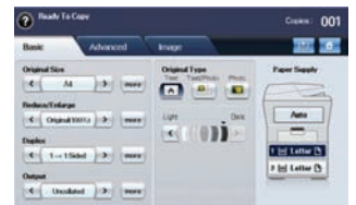
Function Options: Customizable to your needs for improved efficiency.