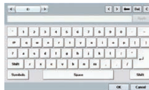
Touch Keyboard: Streamlined to ease individual work processes.